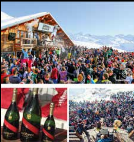
VAL THORENS - FRENCH ALPS