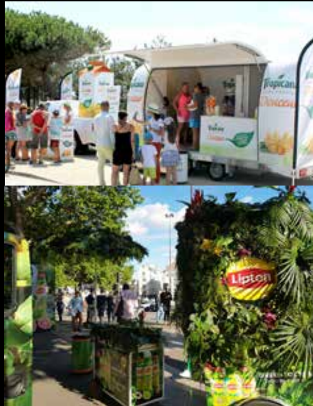
MONTREUIL - PARIS (FRANCE)

BRANDS WE WORK FOR : LIPTON COCA -COLAS PESPSI & CO SAN PELLEGRINO TROPICANA SCHWEPPES LAYS ANDROS NESPRESSO