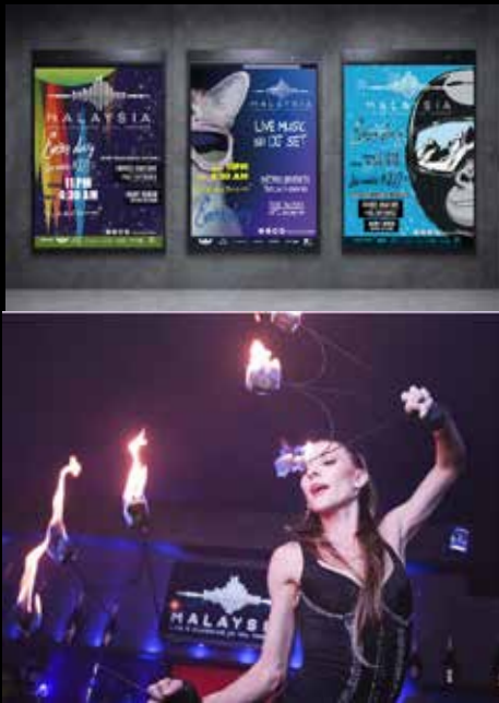
VAL THORENS - FRENCH ALPS