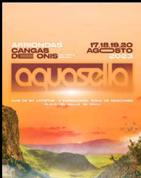
ASTURIAS - SPAIN