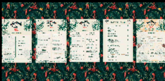
FREELANCE IN EUROPE