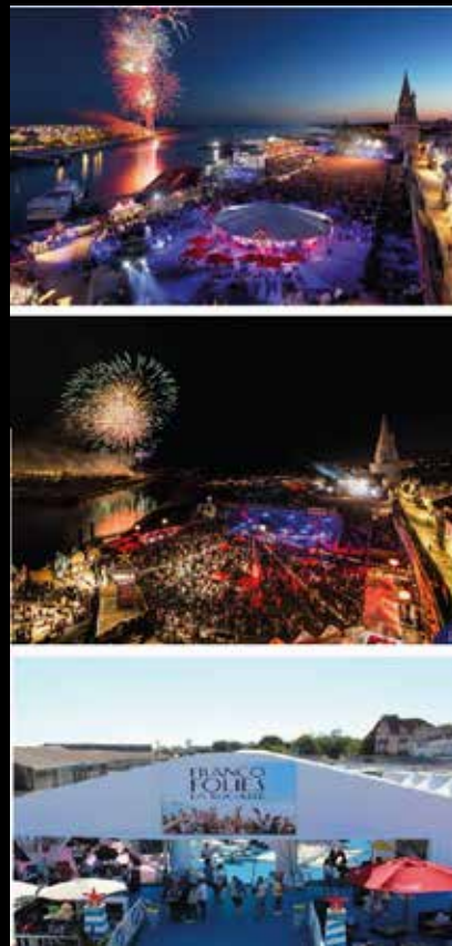
LES FRANCOFOLIES - LA ROCHELLE (FRANCE)