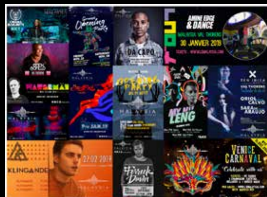
VAL THORENS - FRENCH ALPS